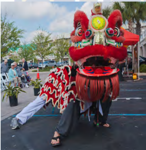
Dragon Dancers