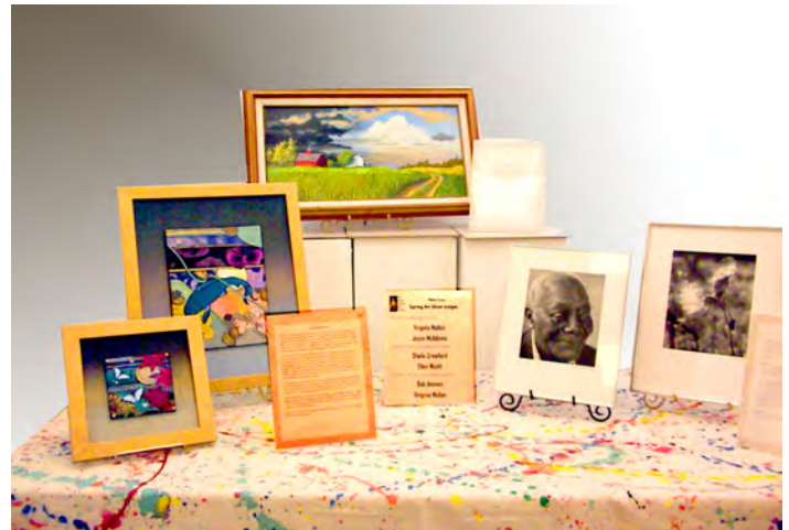
Judges' Bio Table at FCAL Gallery