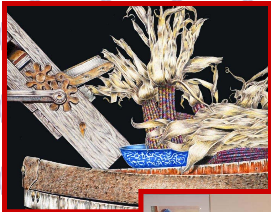
'Aw Shucks' was selected for inclusion in CPUSA's 2010 International Show held in Los Gatos, CA.