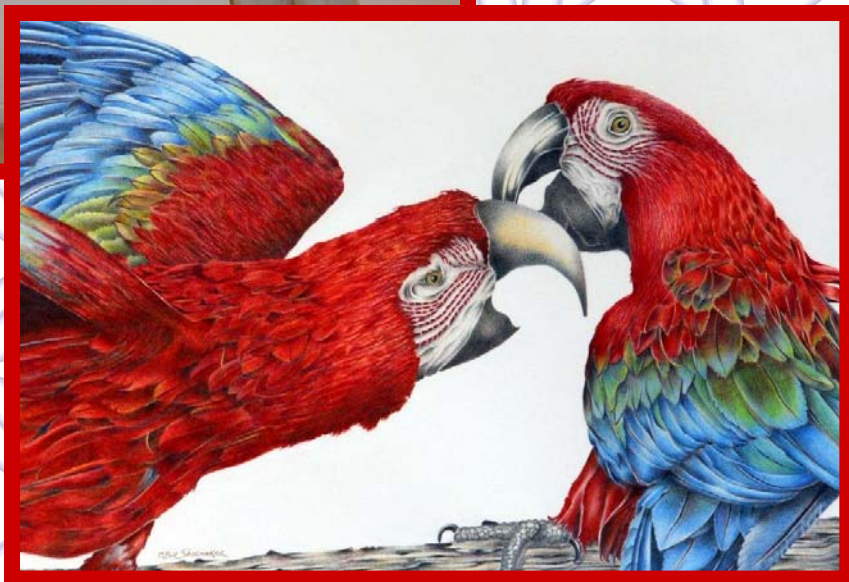
'In Your Face' will be published in a North Light Book, Strokes of Genius #3 , next year.