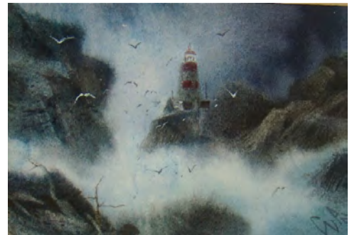
New England Lighthouse

Much of his earlier work featured a dry brush technique, a very laborious process, he noted. Use of stencils helped create a linear quality in his surrealist work. Social and ecological consciousness played a major role in his subject matter of the 60s and '70s. For example, his iconic painting, "The American Yard," part of his American Wasteland series, includes subtly rendered images of the caskets of President John F. Kennedy, Robert Kennedy and Martin Luther King. Another image reflecting the Vietnam era depicts soldiers in the ground, with the flag covering them.