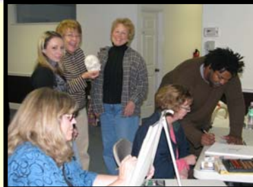
Portrait drawing and sharing some fun