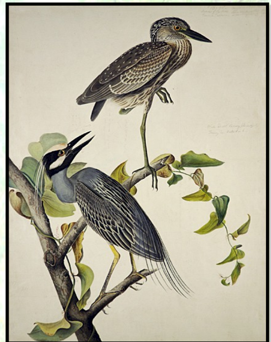
Julius Bien after John James Audubon, Yellow-Crowned Heron , 1831, chromolithograph.

President's Message—continued from front page