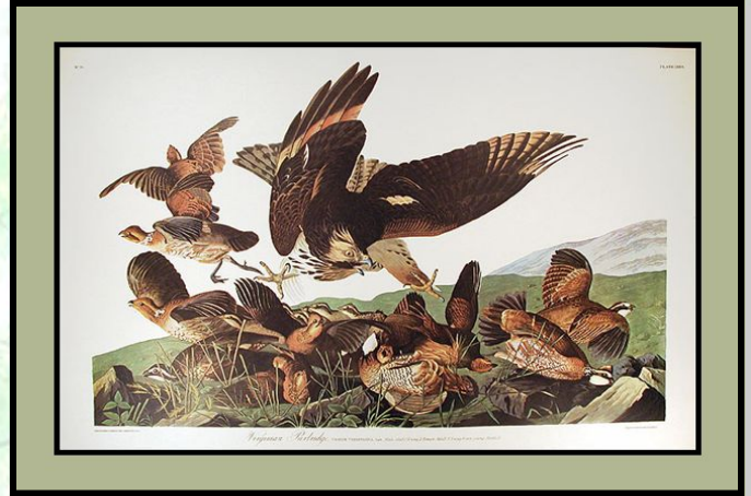
Robert Havell after John James Audubon, Virginian Partridge , 1830, hand-colored etching and aquatint on Whatman paper.