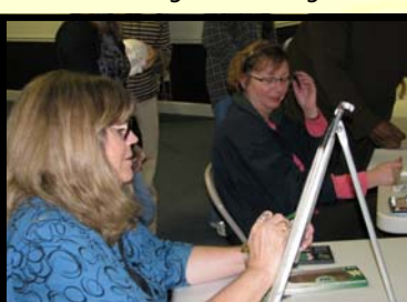
Applying the instruction