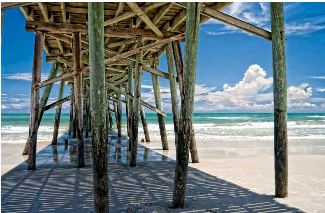
Photo left, Flagler Pier (Best of Show, 2010)

FCAL's second annual photography show is coming up soon! The registration deadline is April 27, and drop-off is on May 11. The show's opening reception will be held May 14, 6-9 p.m.